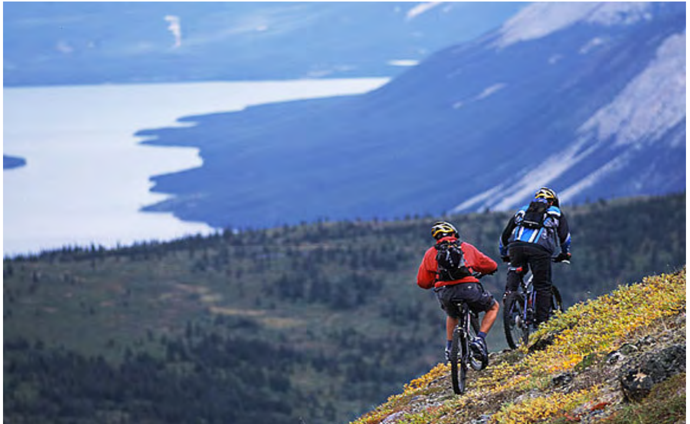
Exploring Silver Rush Trails on Montana Mountain, near Carcross, Yukon Territory